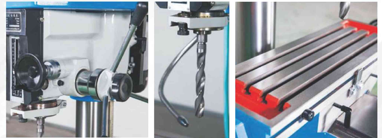
"H" Without collant systems "P" With collant system